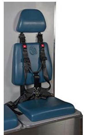
1507-HMR High Mobility Restraint system