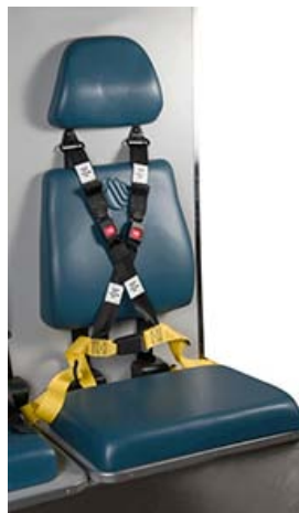
1506-BC Body Centering belt