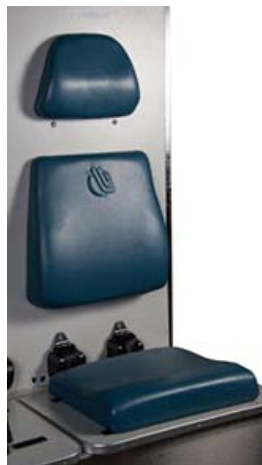
1500 Three-Piece Cushion set (no belts)