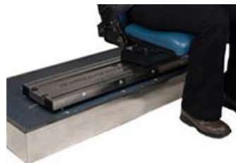
Seat offers up to 48" of track with locking increments every 4" for greater maneuverability