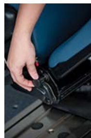
Easy release to flip up seat bottom