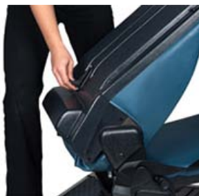
Quick release to fold seat for transporting a second patient