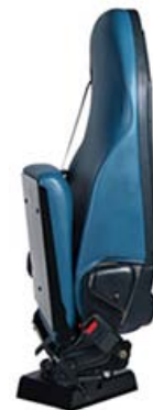
Flip-up option saves space when not in use