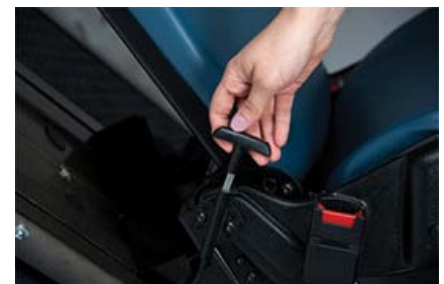
Seat can swivel and lock in 8 different positions with the easy release mechanism