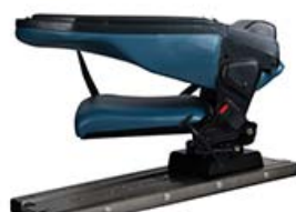
A seat when tilted forward can carry a second patient (300 pound capacity) with the help of a backboard