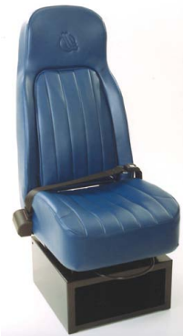
EVS1800 pictured with standard cabinet base.

EVS 1800 Height: 47" Floor to top of seat back Height: 18" Floor to top of seat bottom Width: 18" Side to Side Depth: 28" Front to Back (EVS1800) Depth: 24" Front to Back (EVS1802)