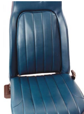
Opening at seat base for easy cleaning and runoff of liquids.