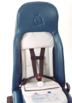
Five-Point safety harness with push-button release.