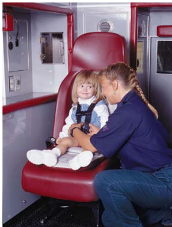
The EVS 1850 Hi-BAC™ Safety Seat makes it easier, safer and more convenient to transport uninjured children just like the original Hi-BAC™ 1800 with one major upgrade –

EVS 1850/1852 48" Overall seat height (on base) 28" Seat depth (edge to wall) - EVS1850 24" Seat depth (edge to wall) - EVS1852 18" Seat width