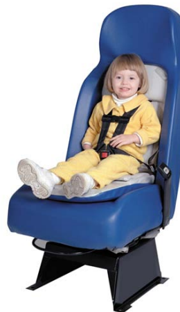
The EVS 1850 Hi-BAC™ Safety Seat, always where you need it, when you need it the most!