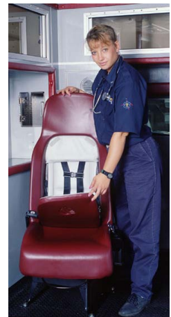
The 1850 is engineered to meet or exceed OSHA's standards for the removal of blood borne pathogens. Everything you have come to expect from E.V.S., Ltd. and the Hi-BAC™ Safety Seat is built into the 1850