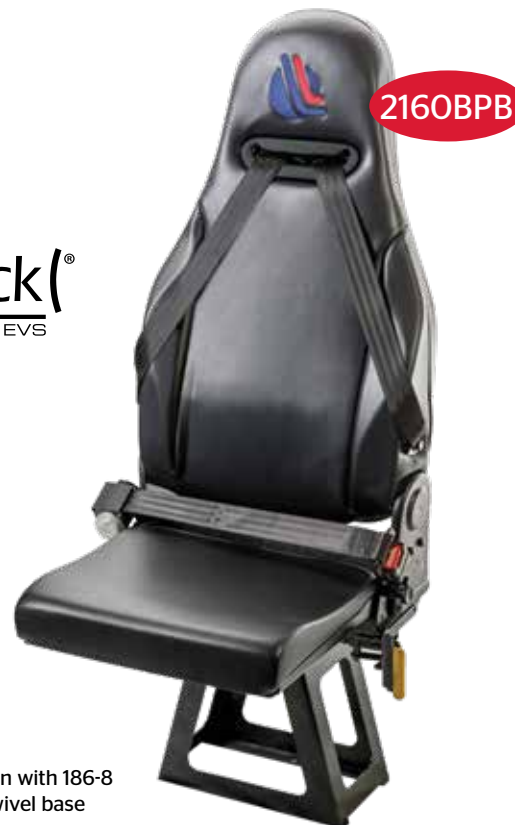
shown with 186-8 swivel base