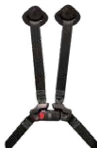
IMMI 4-pt. Belt