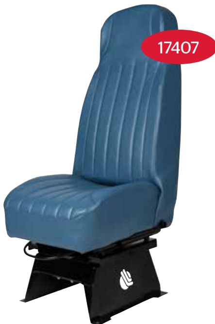
Sewn version shown with SB8 swivel base

EVS Standard Attendant Seats 17507 and 17407 set the bar for Emergency Transportation Vehicle safety and comfort when EMTs are assisting patients in their day-to-day work. Both versions of the EVS Standard Attendant seats are constructed with a molded foam back with lumbar support to ensure maximum comfort with secure seating use. The industrial-strength, double-locking slide track and release bar ensures the kind of reliable functionality EMTs need to provide exemplary transport care to their patients as efficiently as possible. All standard seats are available with a 6- or 10.5-degree back and come with 2-point belting. The EVS Standard Attendant seat design prioritizes both required safety standards and desired comfort.