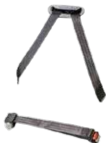
Back Pack Belt