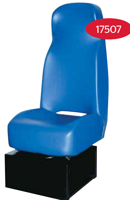
Seamless Shown with cabinet base

VIEW DIMENSIONS AND SPECIFICATIONS ON OUR WEBSITE AT EVSLTD.COM