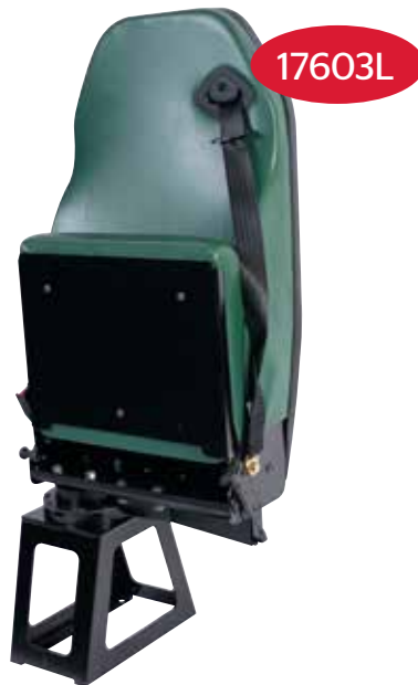
Shown offset right mounted on a SB186-8R swivel base

The 1769 has the additional features of a tilt-forward seat engineered to transport a second patient with ABS with skid-proofing, as well as the functionality that when tilted forward, the 1769 seat can handle up to 300 pounds, which helps EMTs care for patients.