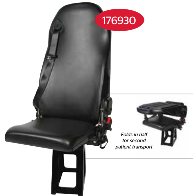
Shown center mounted on a SB186-8C swivel base